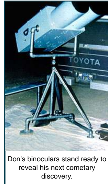
Don's binoculars stand ready to reveal his next cometary discovery.

The binoculars I used were homemade, designed and developed by myself in the spring of 1983. It was built for under $400 from surplus lenses and eyepieces, mounted in a plywood box measuring 3' long, 2' wide and 1' high. This box of optics weighs over 100 pounds so I attach it to the top of a pipe alt-azimuth tripod mount. The front objectives are aerial lenses, each consisting of five elements, the front measuring 6.1" in diameter. The lens system is rated as 36" focal length with a focal ratio of 8; this implies a 4.5"